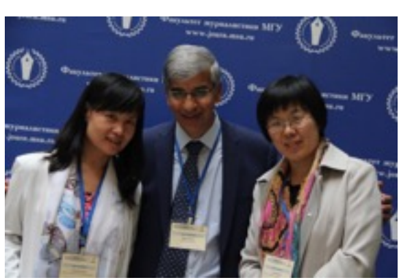
Call for papers! Disruption In Media Industries: Management And Education Challenges in Seoul, Korea 27 – 30 October 2016