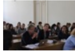
2015 SEPTEMBER CONFERENCE: MOSCOW, RUSSIA