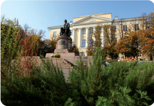
Faculty of Journalism, Lomonosov Moscow State University